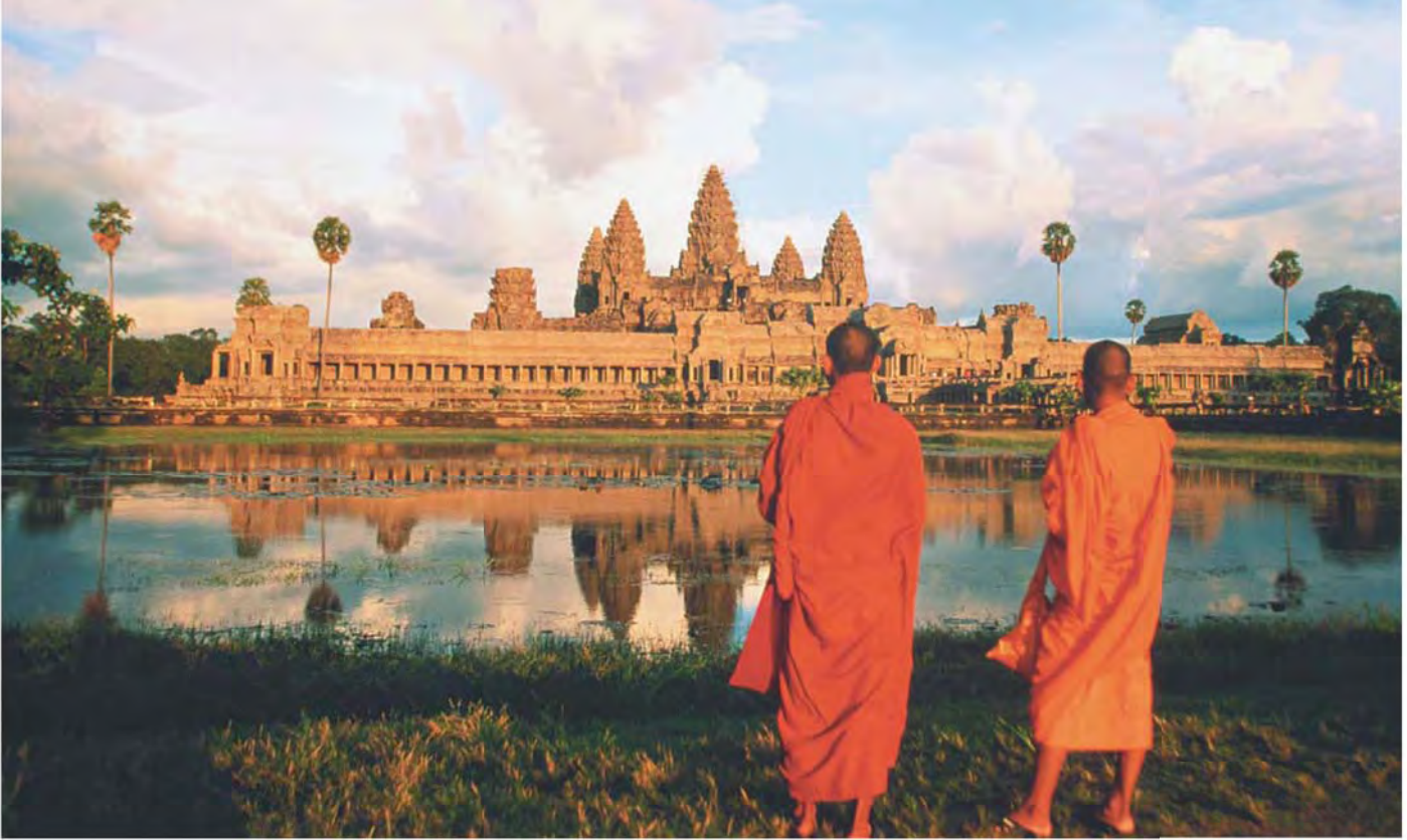
▲ Buddhist monks view a temple at Angkor Wat in Cambodia.

The Religious Community The five disciples who heard the Buddha’s first sermon were the first monks admitted to the sangha , or Buddhist religious order. At first, the sangha was a community of Buddhist monks and nuns. However, sangha eventually referred to the entire religious community. It included Buddhist laity (those who hadn’t devoted their entire life to religion). The religious community, together with the Buddha and the dharma (Buddhist doctrine or teachings), make up the “Three Jewels” of Buddhism.