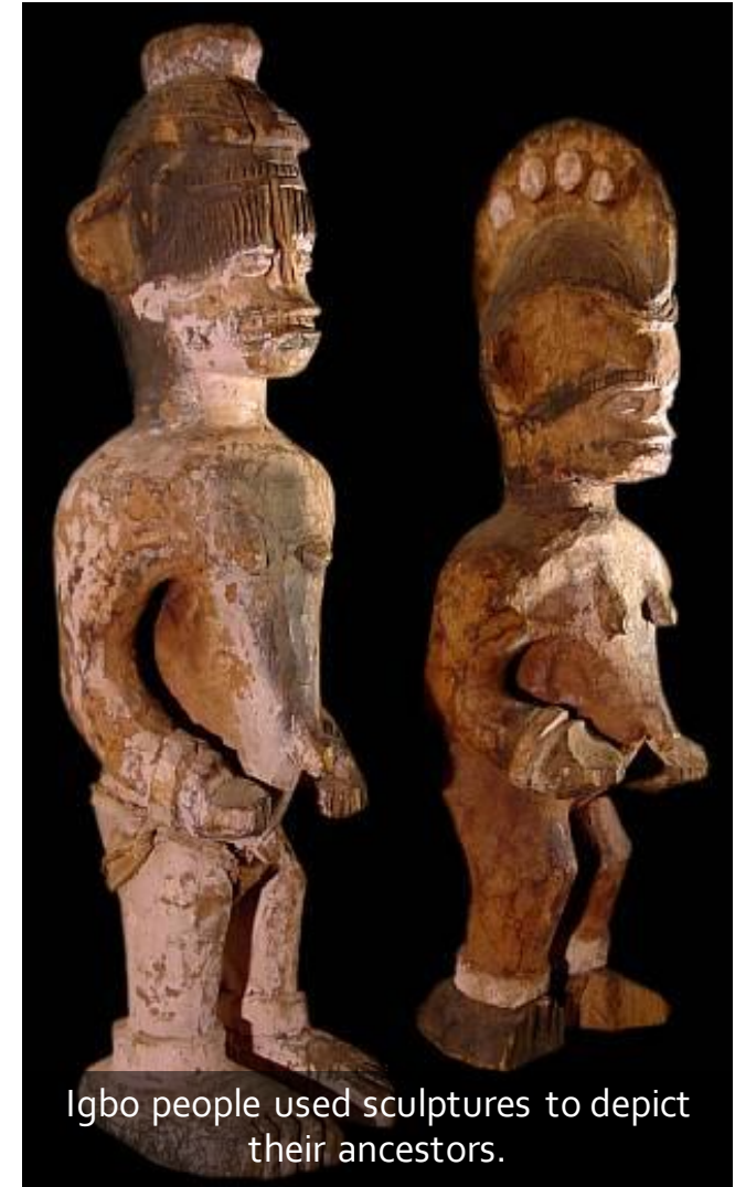
Igbo people used sculptures to depict their ancestors.