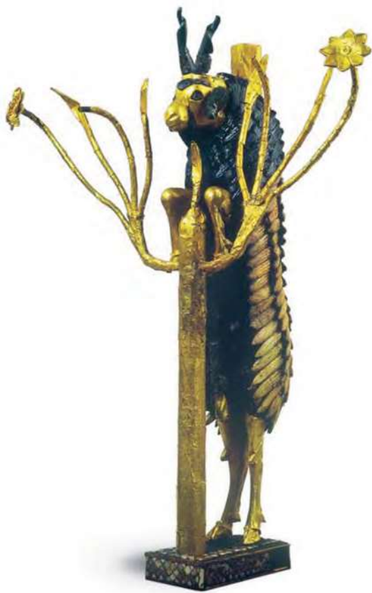
▲ This gold and lapis ram with a shell fleece was found in a royal burial tomb.

Sumerians built impressive ziggurats for them and offered rich sacrifices of animals, food, and wine.