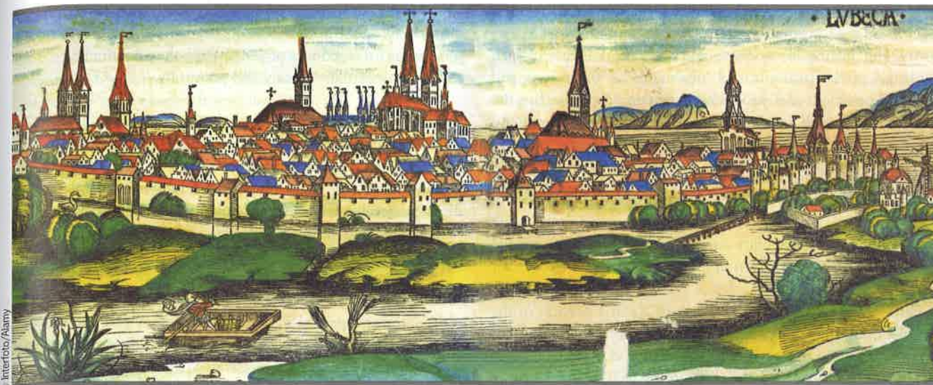
Lübeck and the Hanseatic League. The Hanseatic League or Hansa was an economic and military alliance of northern European trading cities that established a monopoly on trade from the Baltic to the North Sea. The city of Lübeck in northern Germany played a major role in the founding of the Hanseatic League and became known as the "Queen of the Hansa." This colored woodcut by Michael Wohlgemut in Hartmann Schedel's Chronicle of the World presents a panoramic view of this prosperous German city.

EXPANSION OF TRADE As early as the thirteenth century, a number of North German coastal towns had formed a commercial and military association known as the Hansa, or Hanseatic League. By 1500, more than eighty cities belonged to the League, which had established settlements and commercial bases in many cities in England and northern Europe, including the chief towns of Denmark, Norway, and Sweden. For almost two hundred years, the Hansa had a monopoly on northern European trade in timber, fish, grain, metals, honey, and wines. Its southern outlet in Flanders, the port city of