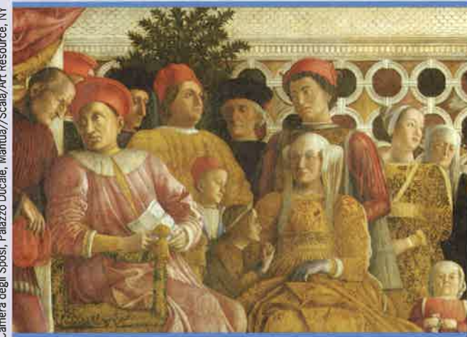
Camera degli Spesi, Palazzo Ducale, Mantua

presence of a priest, but it was not necessary. The wedding was then recorded in a marriage contract that was considered a crucial part of the marital arrangements. So was a wedding feast, as seen in the painting by Sandro Botticelli at the bottom. It shows the wedding banquet that celebrated the marriage of Nastagio degli Onesti and the daughter of Paulo Traversaro in Florence. After the feast, the couple retired to a bedroom, usually in the house of the bride, where they physically consummated their marriage. Later, the husband introduced his bride to his household, usually on Sunday, in order to make it public knowledge that the marriage had been consummated. ☞