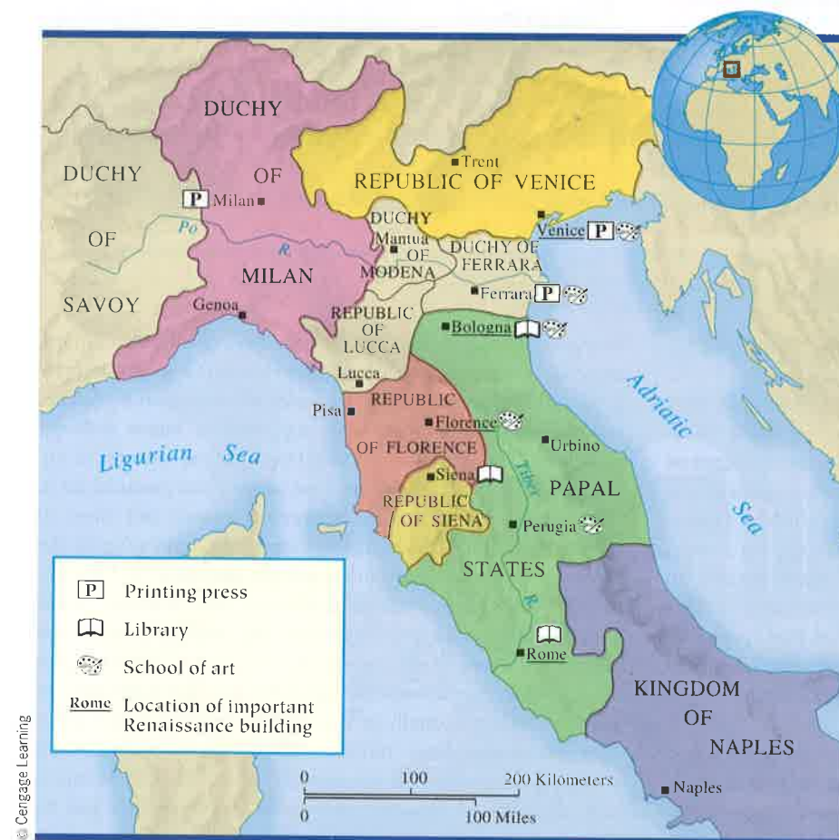
MAP 12.1 Renaissance Italy. Italy in the late fourteenth century was a land of five major states and numerous independent city-states. Increased prosperity and a supportive intellectual climate helped create the atmosphere for the middle and upper classes to “rediscover” Greco-Roman culture. Modern diplomacy was also a product of Renaissance Italy.

Perhaps the most famous of the Renaissance ruling women was Isabella d'Este (1474–1539), daughter of the duke of Ferrara, who married Francesco Gonzaga, marquis of Mantua. Their court was another important center of art and learning in the Renaissance. Educated at the brilliant court of Ferrara, Isabella was known for her intelligence and political wisdom. Called the “first lady of the world,” she attracted artists and intellectuals to the Mantuan court and was responsible for